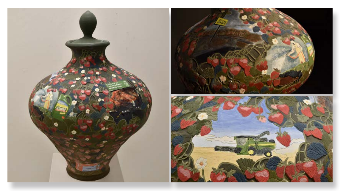
We Will Soon Be Rotten