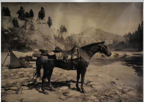
All, untitled, from the series A World Apart