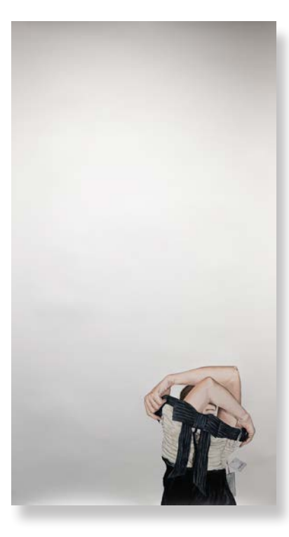
Conform Color pencil on paper 30.5" x 55.5" December 2023