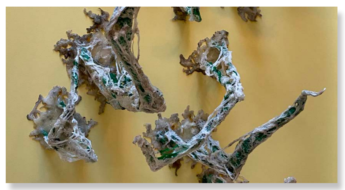
bahamut (emergent) Polypropylene, polyethylene tubing, tennis racquet string, steel, epoxy, bubble wrap, wax